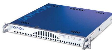
ES5000 (ES8000 is identical) and ES1000: fully integrated email gateway protection from Sophos